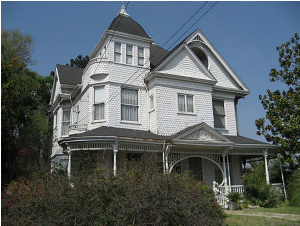
Figure 3. Crown Hill, circa 1885.